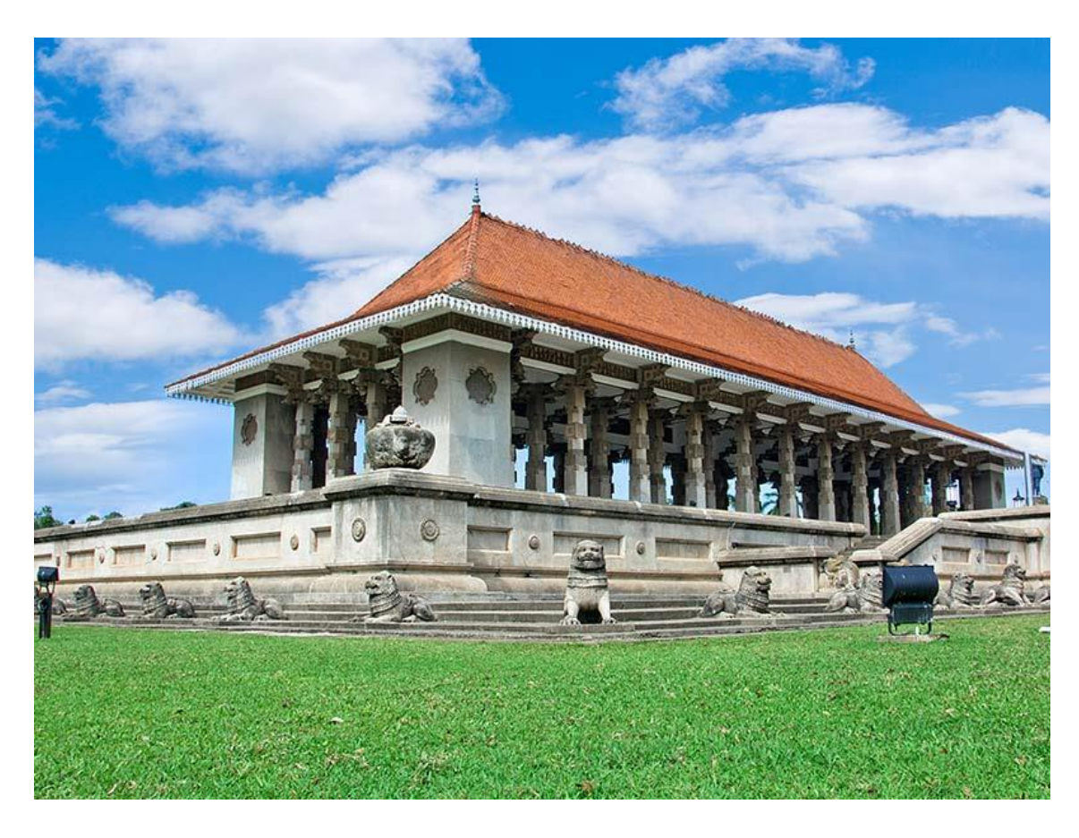
4:00 PM: Explore Viharamahadevi Park, the largest and best park in Colombo. Take a breather under the beautiful canopy of trees and capture the park's attractions like the aquarium, children's play zone, war memorial, lake, and suspension bridge.