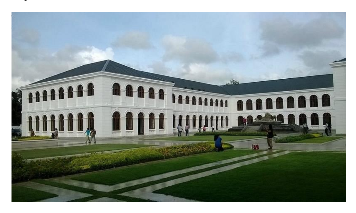
3:00 PM: Visit Independence Square, a historical landmark that represents Sri Lanka's independence. Capture the beautifully landscaped gardens and the iconic Independence Memorial Hall as great photo backdrops.

1:30 PM: Explore the colonial charm of the Colombo Fort area, where you'll find beautiful colonial-era buildings, including the Old Parliament Building, Galle Buck lighthouse, clock tower, Lloyd's building, and St. Peter's church. Take advantage of the unique photo opportunities amidst the vintage architecture.